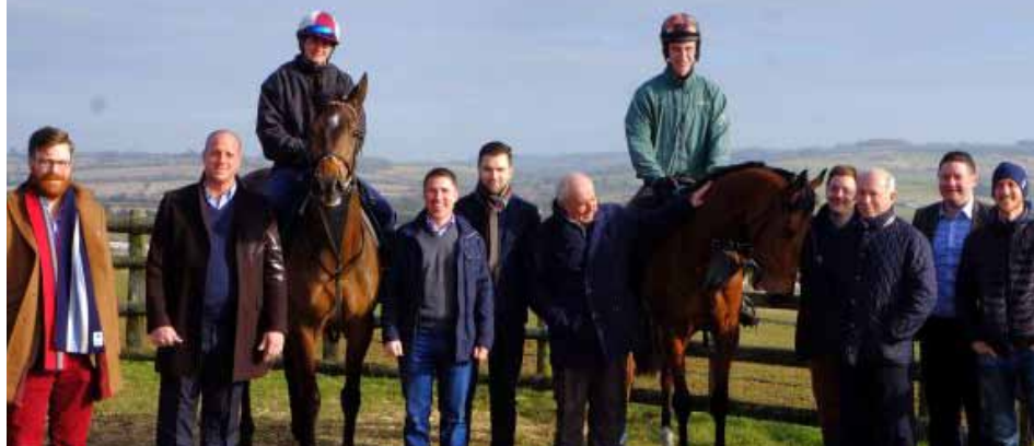
Allez Encore (L) and King Simba (R) with some of their owners