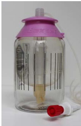
Infusion device full

You should check your device every 8-12 hours to see that it is shrinking. If you have a concern it is not shrinking please see the troubleshooting section.