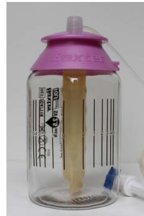
Infusion device empty