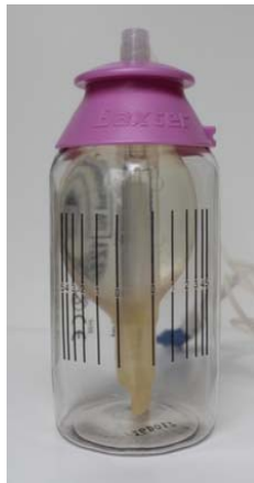
Infusion device half-full