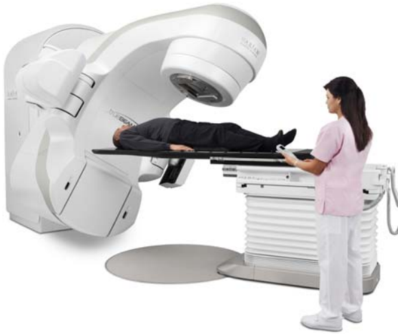
Linear accelerator (linac)