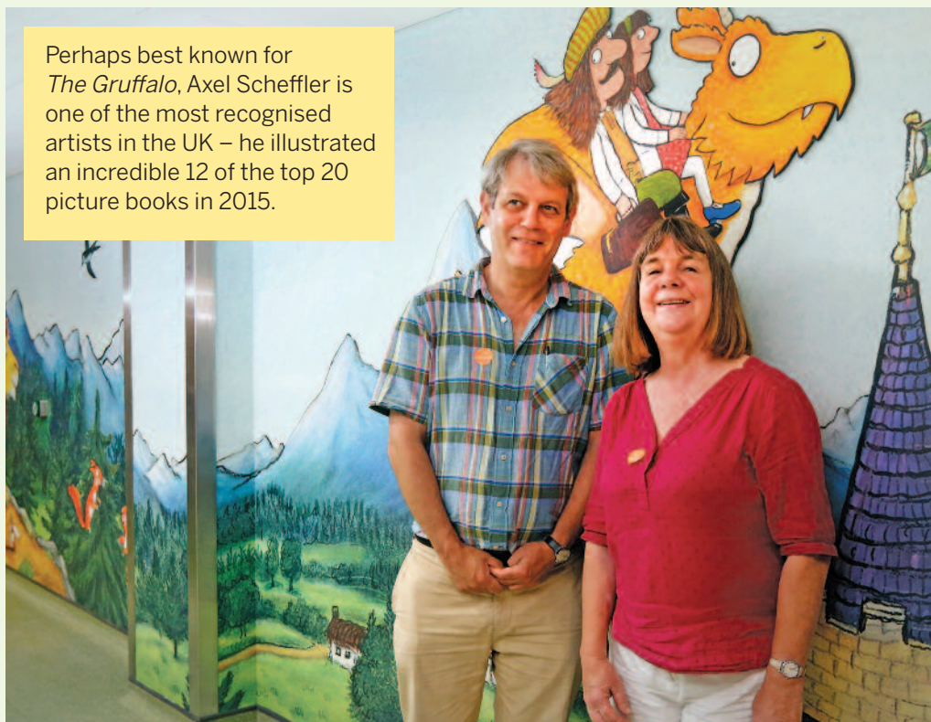
Axel Scheffler and Julia Donaldson in front of the mural

Perhaps best known for The Gruffalo , Axel Scheffler is one of the most recognised artists in the UK – he illustrated an incredible 12 of the top 20 picture books in 2015.