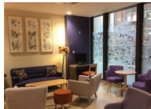
Dimbleby Cancer Care offers a welcoming and tranquil environment