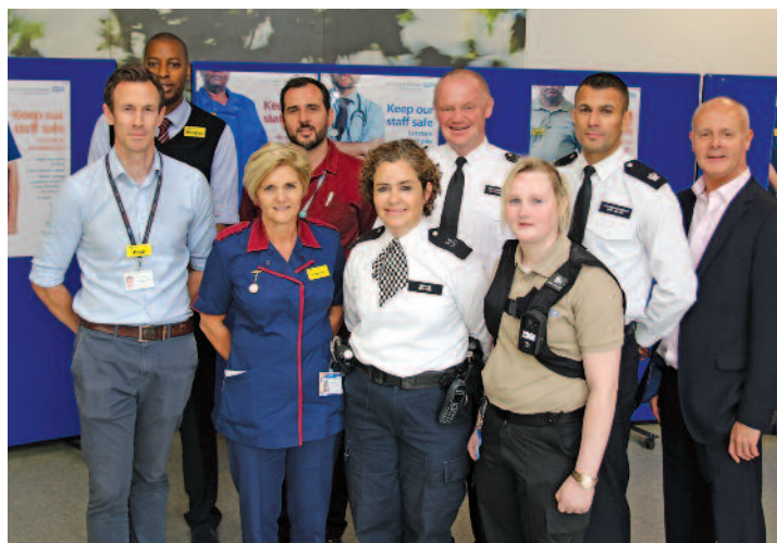
The launch of the Keep our staff safe campaign

"If the pilot here is successful I would hope it is something that other NHS trusts would look to roll out across London."