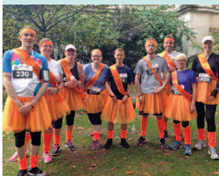
Radiotherapists take on Guy's Urban Challenge to raise money for the Cancer Centre at Guy's