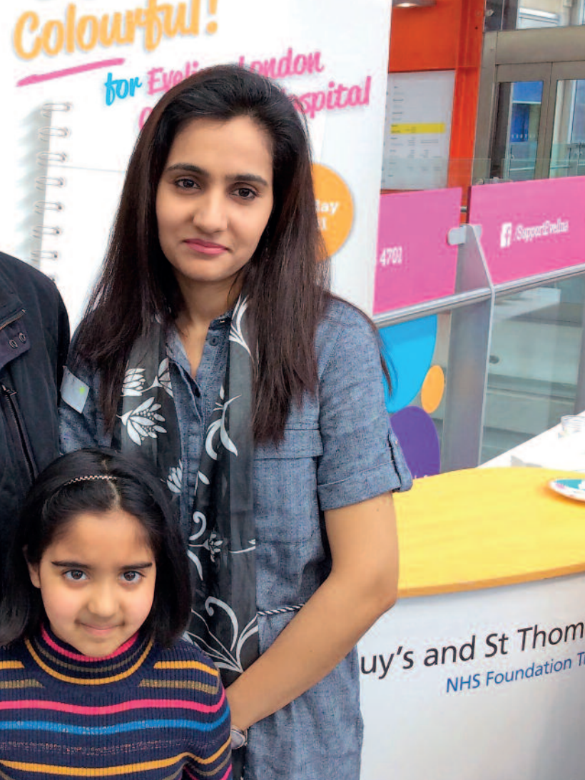
one of her regular visits to Evelina London Children's Hospital