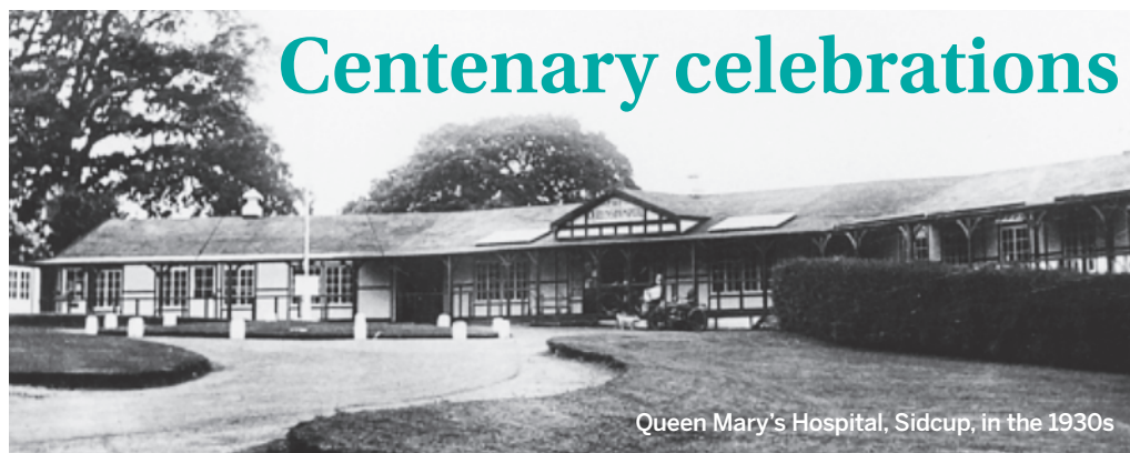
Queen Mary's Hospital, Sidcup, in the 1930s

You can sign up as an organ donor at www.organdonation.nhs.uk .